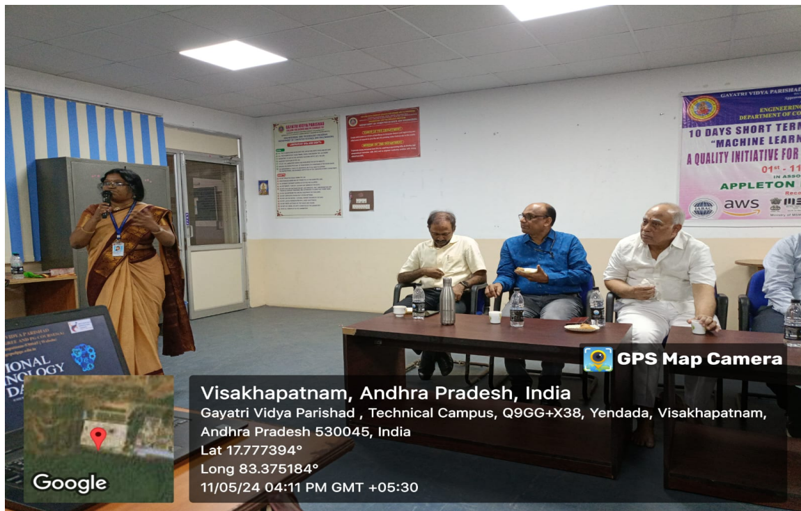
Feedback by non-Computer Engineering Faculty about 10 Days STTP on ML using Python