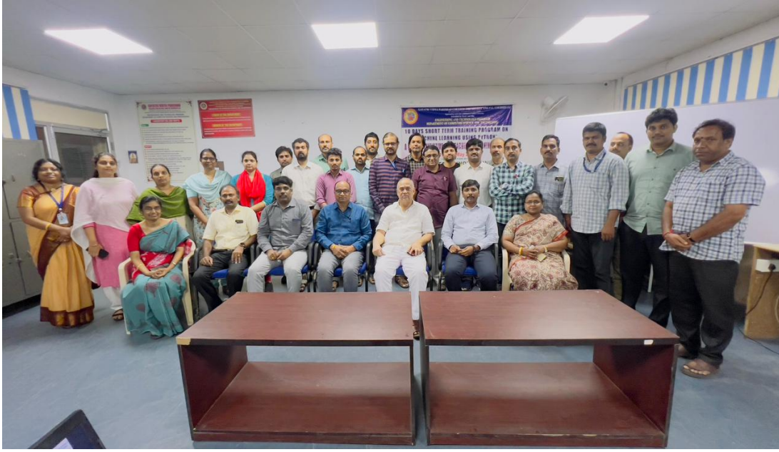
Group photo of all the STTP participants