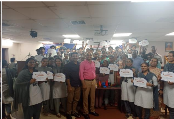
TRAINED STUDENTS WITH CERTIFICATES