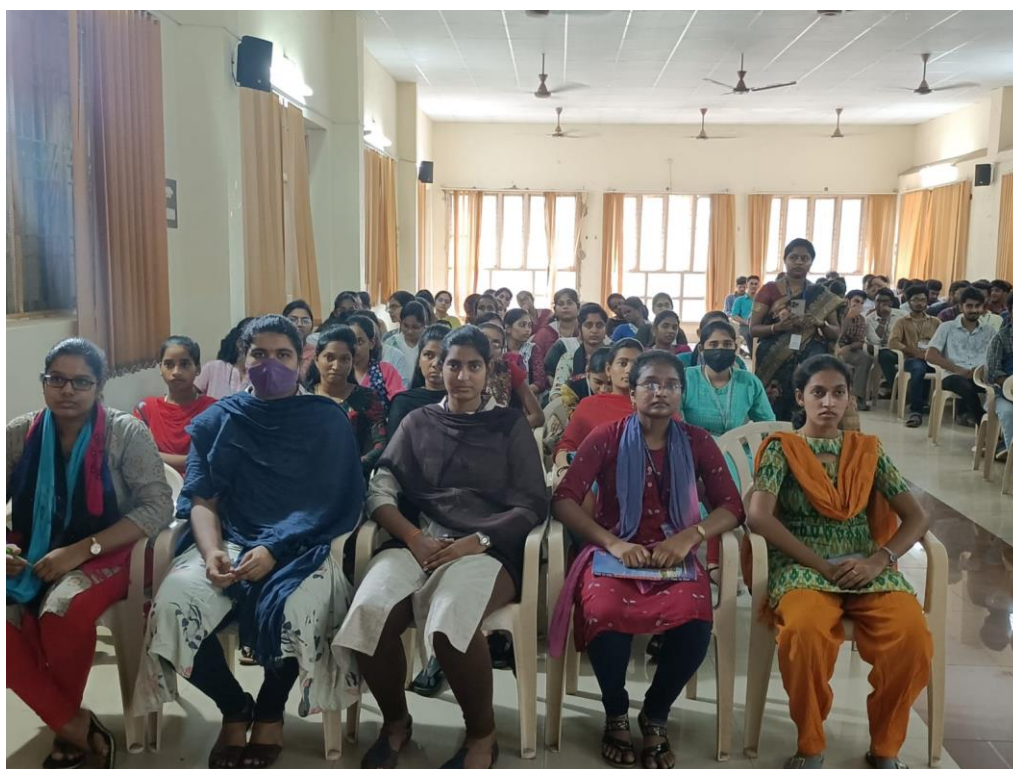
Students of different program attended to the session